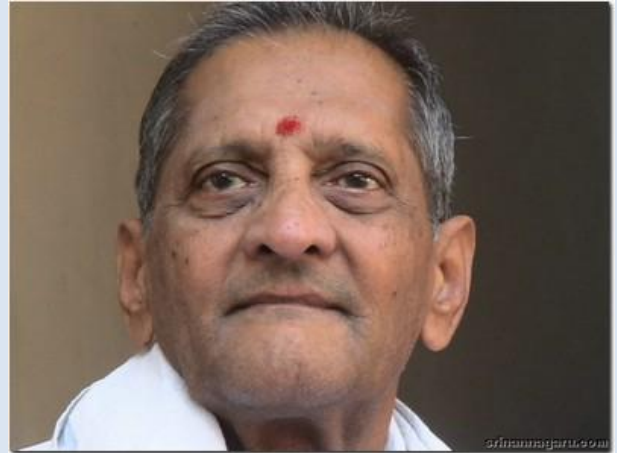
Dispeller of darkness